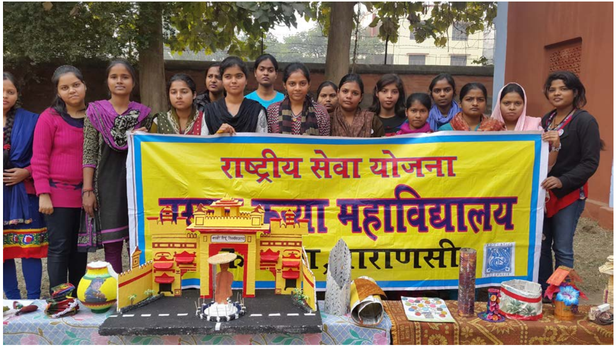
Students displaying their creativity during NSS