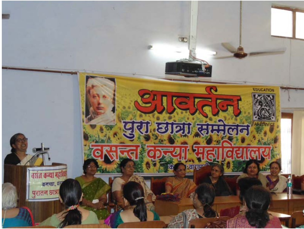
9th Alumni Meet - AVARTAN held on 15.4.2013