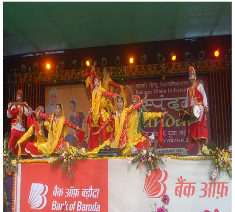
Students of the college performing in Spandan