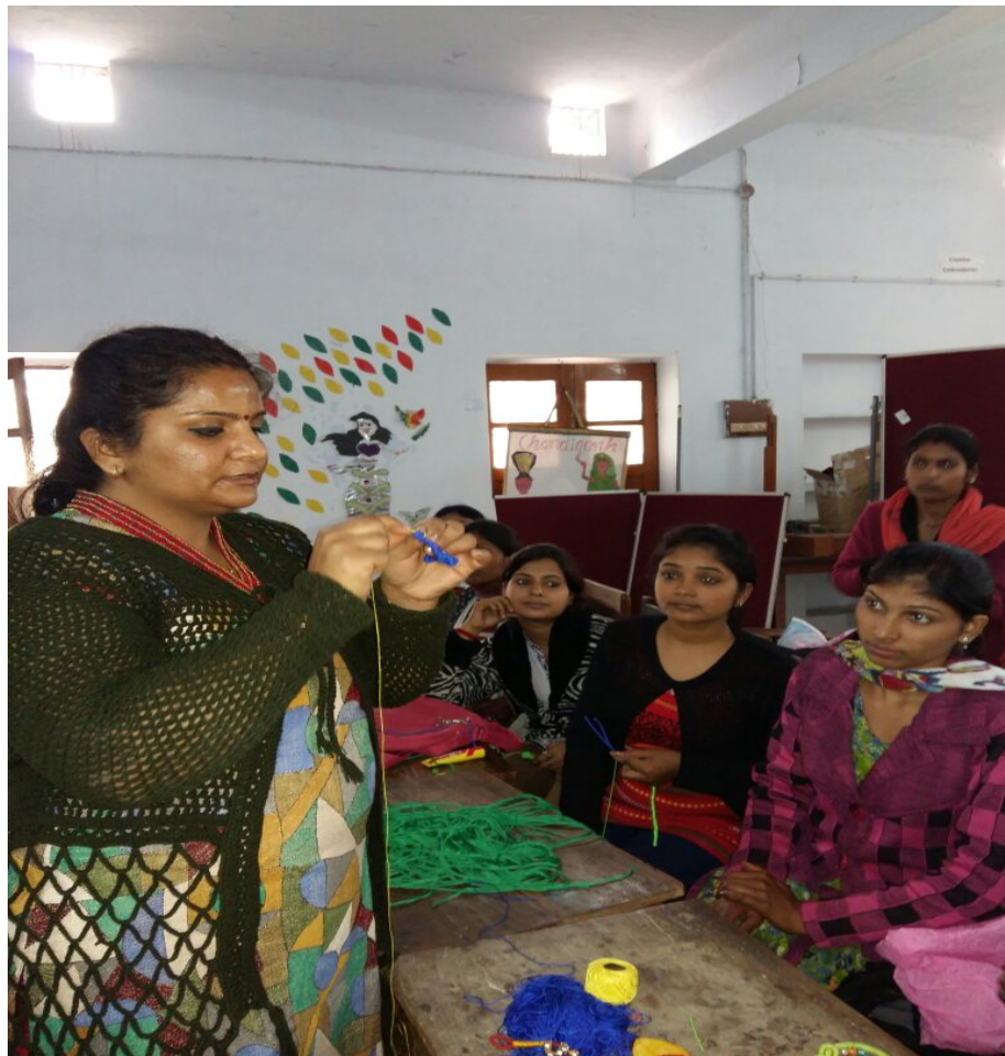
Students at a workshop organized by the Department of Home Science