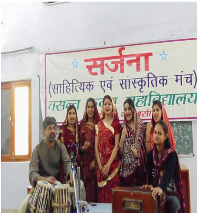
Students in the cultural forum of the College- Sarjana