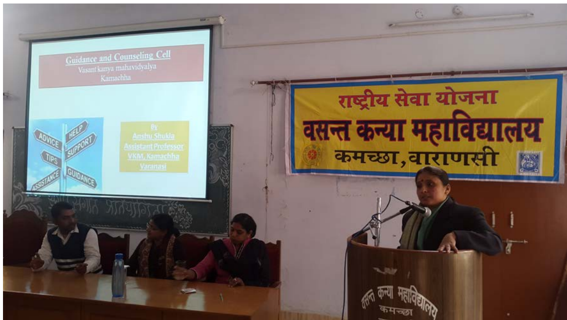
Information given to students during NSS regarding Guidance and Counselling