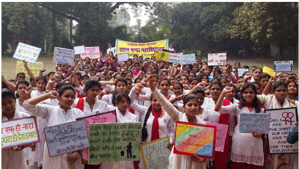
NSS Volunteers taking out a rally to create awareness regarding health and other social issues