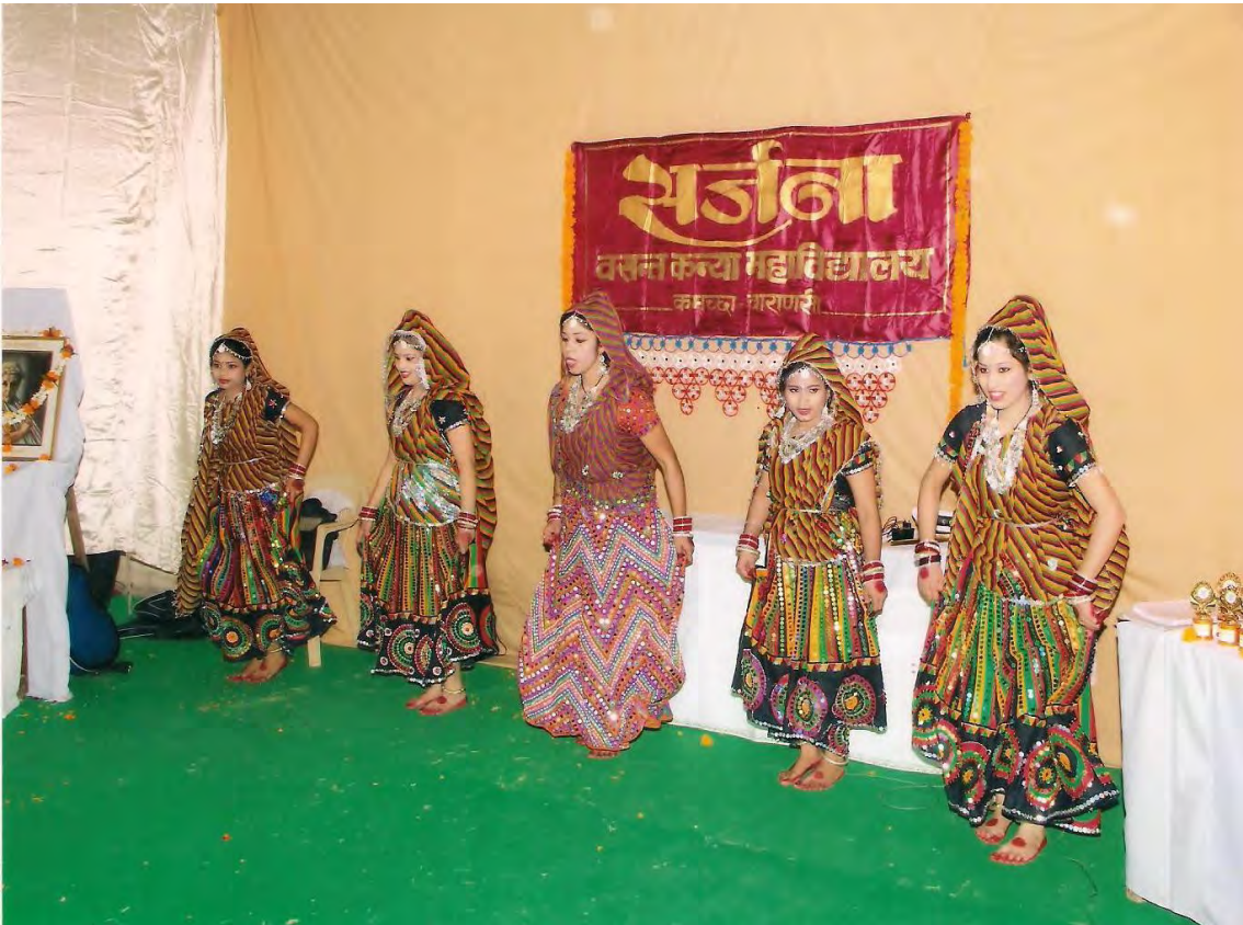
Students performing in Sarjana, 2011-12.