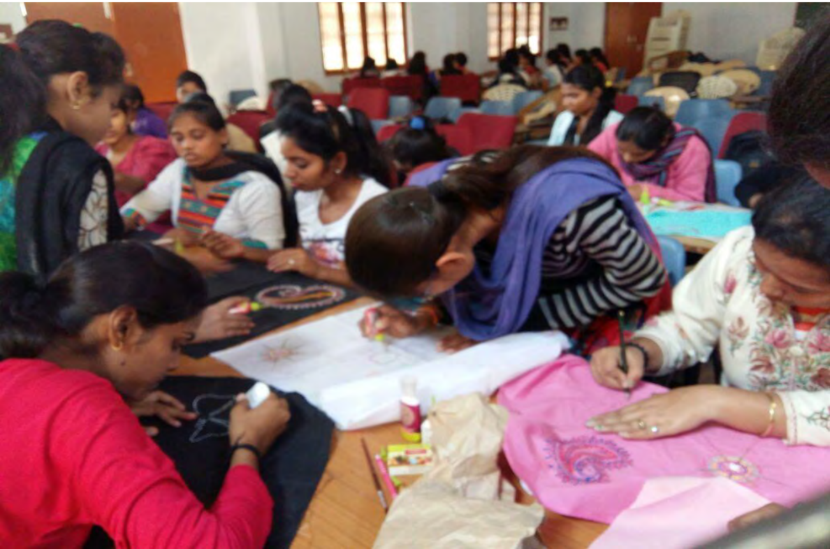
Students of Home Science preparing for Exhibition.