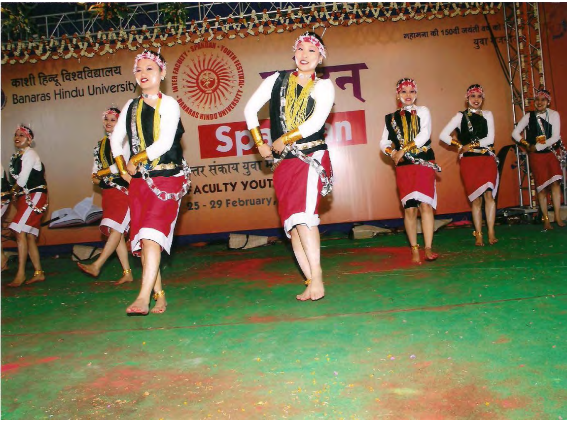
Students performing in Spandan, 2011-12. V.K.M. won I Prize in Folk Dance.