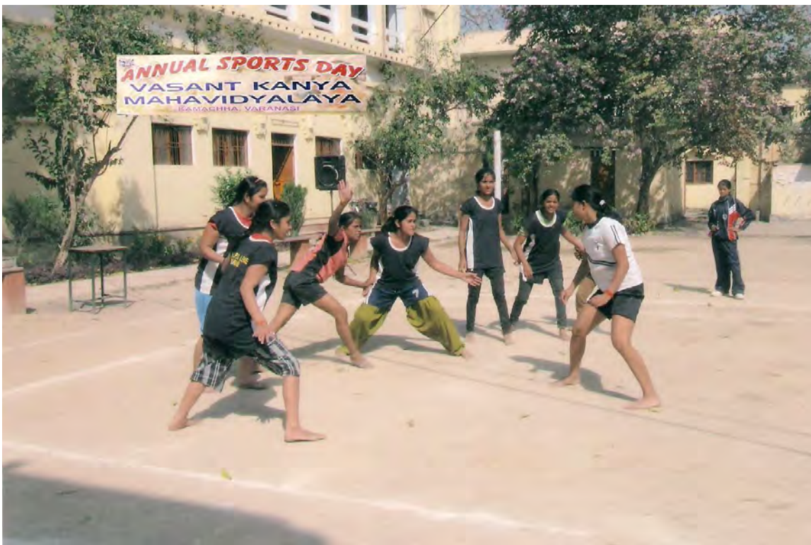
Students participating in Kabaddi competition on the occasion of Annual Sports Day.